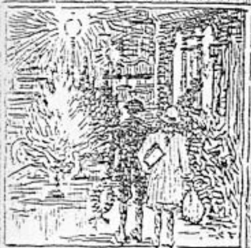
CHRISTMAS SCENE ON PARK ROW