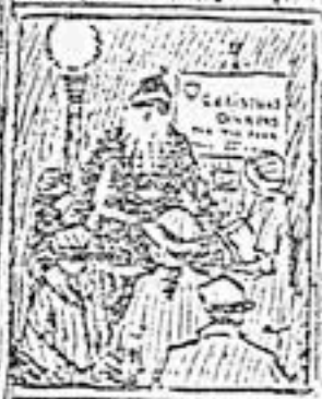
SANTA CLAUS VISITS STAMFORD